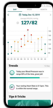
The Aktia App